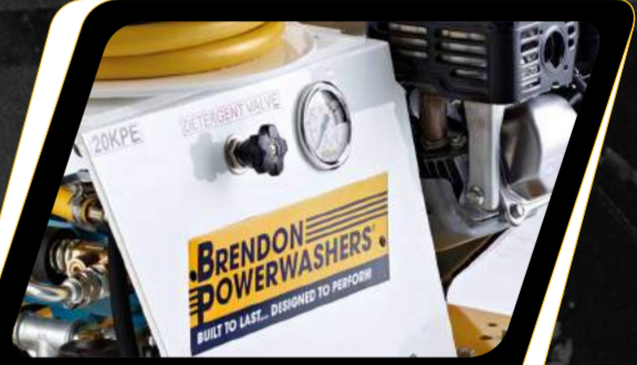
Polypropylene Canopy with Detergent Control Valve and Pressure Gauge