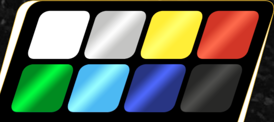
Large choice of Tank & Chassis Colour Combinations