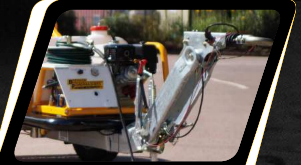
Choice of 50mm Ball or Eye couplings - Alko Adjustable Hitch available