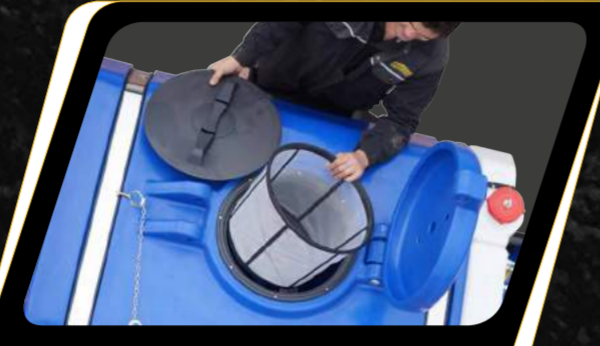
Lockable Hinged Tank Lid with removable Basket Filter