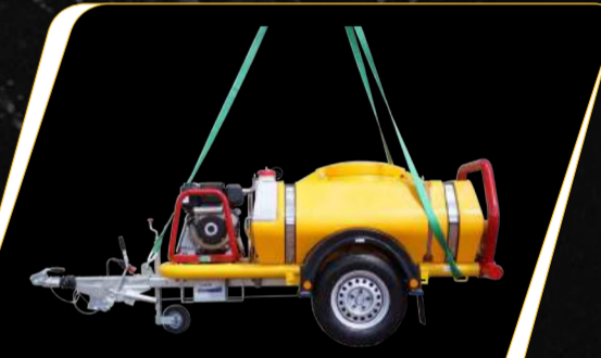
3 Point Lifting Points