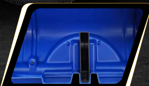
10mm Thick & Baffled Tank