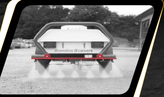
Optional Extra: Rear mounted spray bar for dust suppression