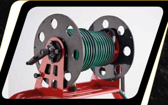
Optional Extra: Manual or 12V DC Electric Hose Reels for 30M - 100M of HP Hose