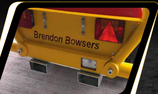
Optional Extra: Rear Forklift Points